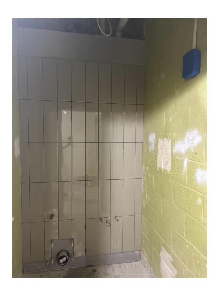
Installing ceramic tiling in restrooms on level 1.