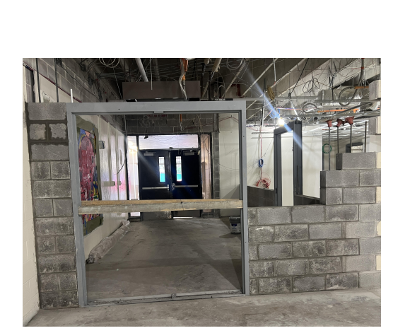
Installing CMU and a door frame in corridor on level 2.